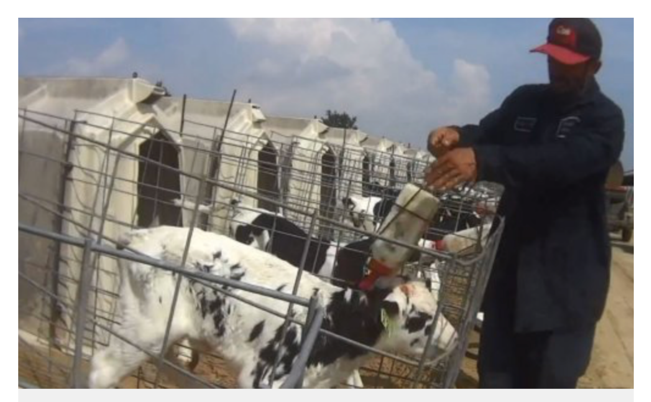
The workers force-fed the calves