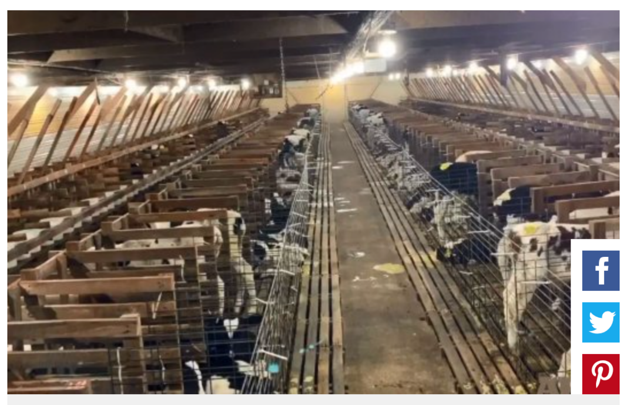
The animals can be seen in overcrowded, filthy and hot conditions (Picture: Animal Recovery Mission)