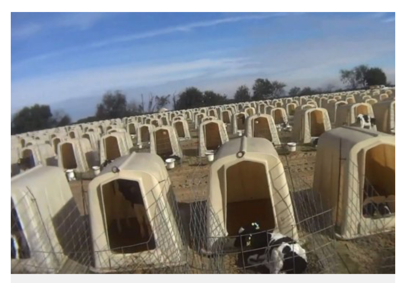
The video showed the animals getting thrown into tiny plastic enclosures