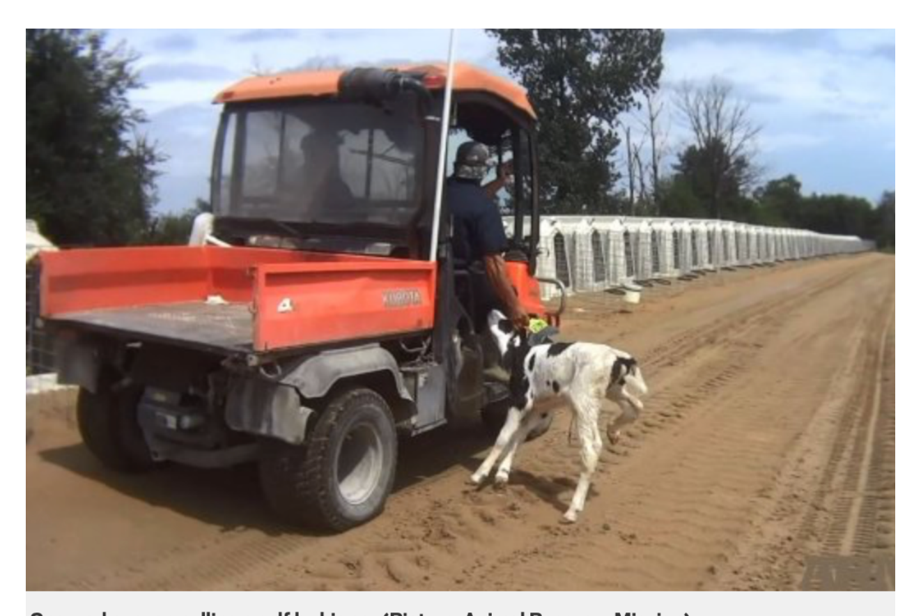
One worker seen pulling a calf by his ear