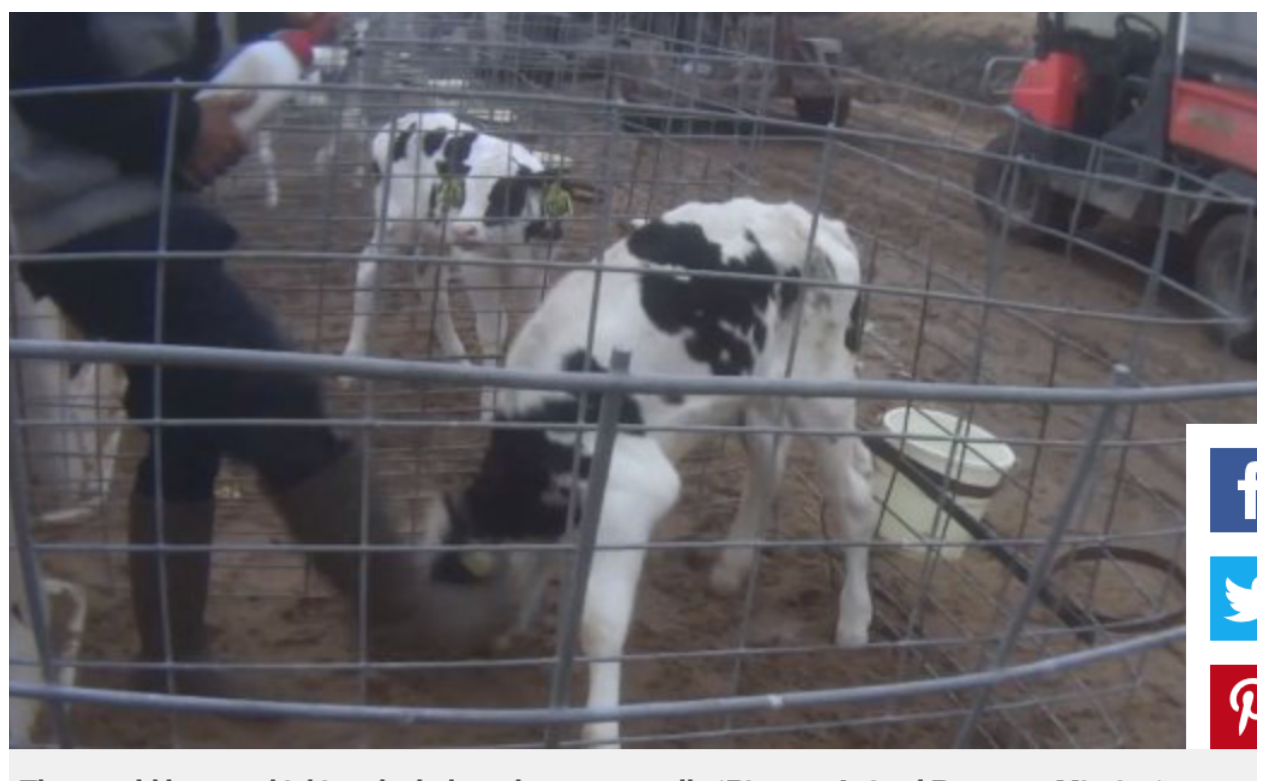
They could be seen kicking the baby calves repeatedly