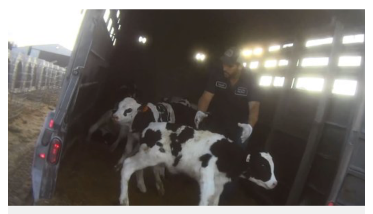
An investigation has been launched since the animals rights group released the video