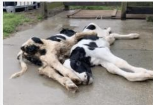
Dead calves thrown away like trash.