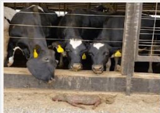
Mother Cows Grieving Over Dead Calf!