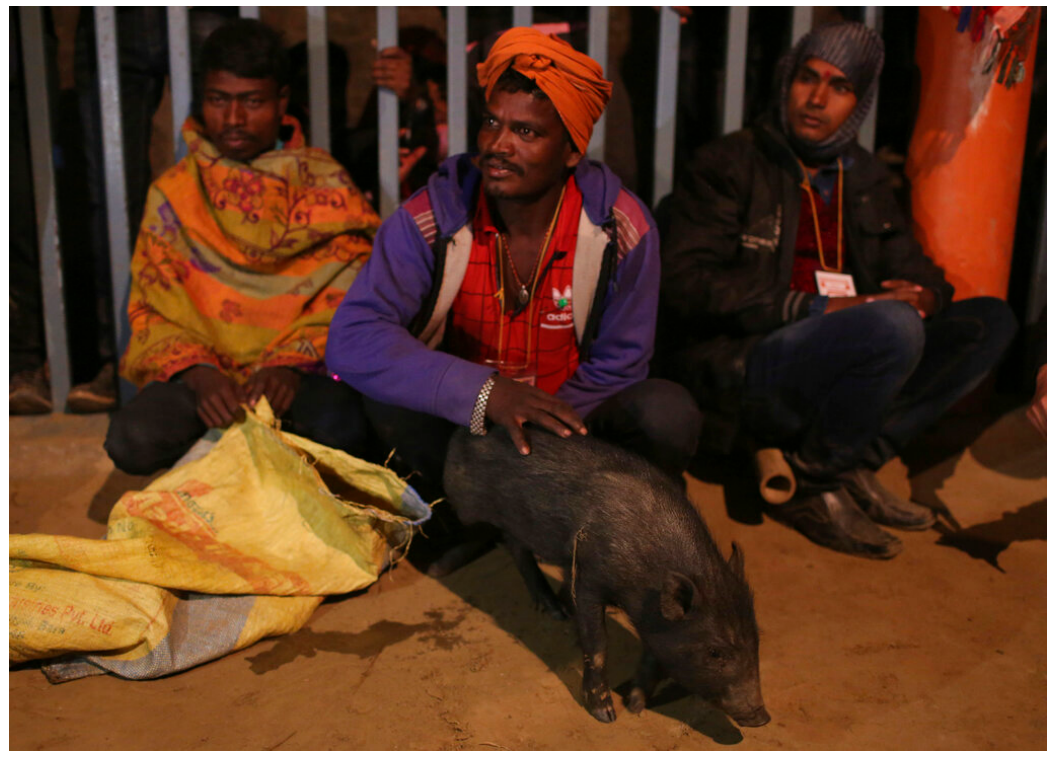
In May, the heavy metal band Underside from Nepal released a song about the festival. They strongly condemned the