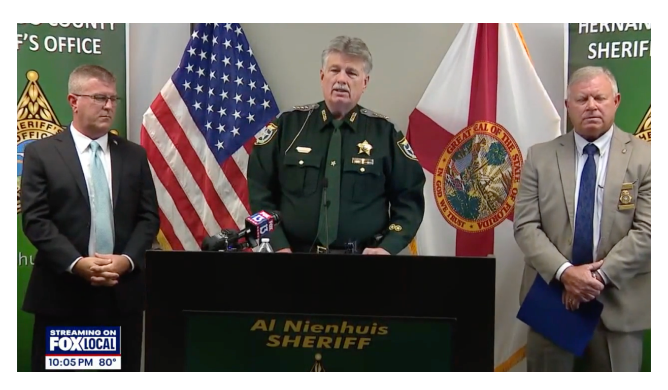
FOX 13 Investigates: Black market horse meat

By Genevieve Curtis Published July 25, 2024 11:31pm EDT Brooksville FOX 13 News