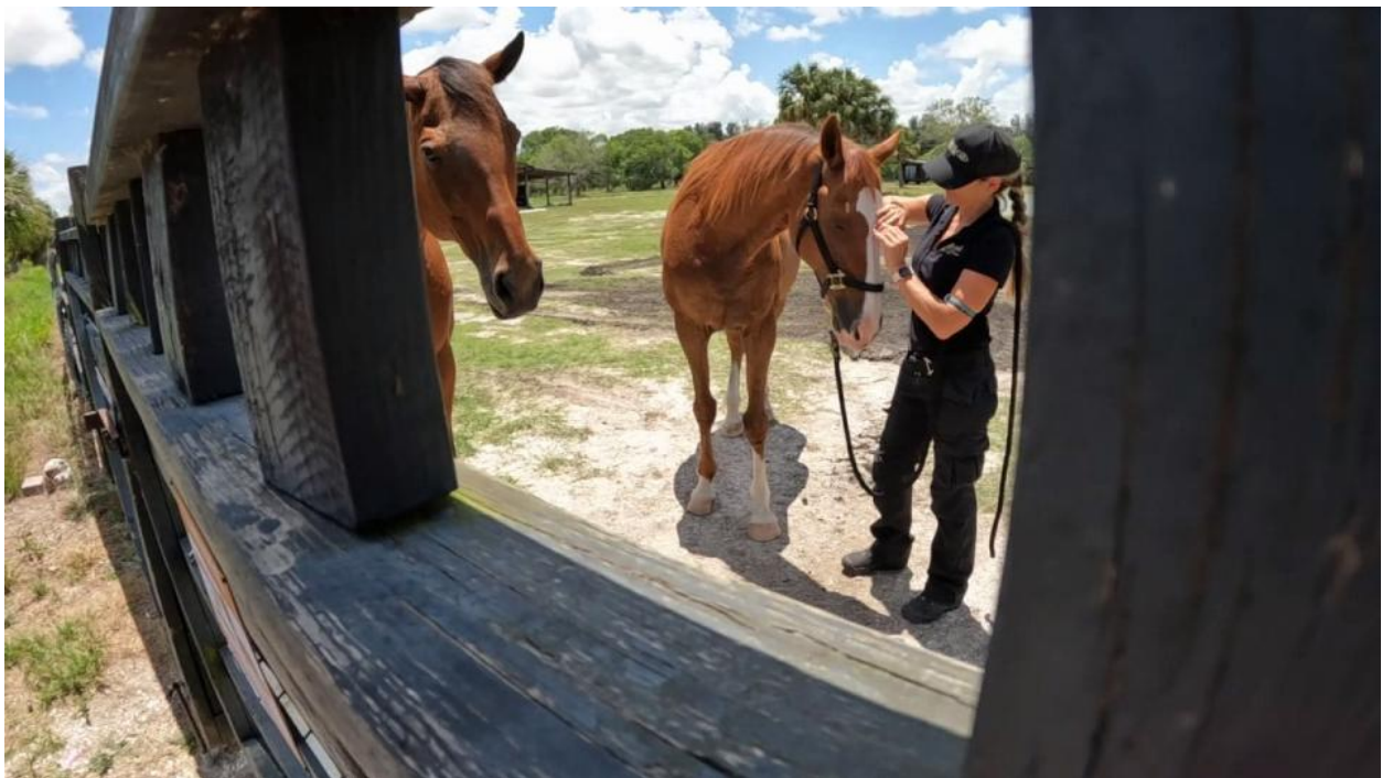
Pictured: Freedom at the sanctuary.

Horse meat has been historically prevalent on the black market in south Florida, where some cultures consider it a delicacy, driving the demand for it.